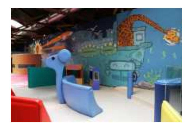
Gallery A9 and A10 – Children Art museum