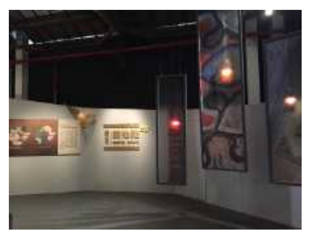
Gallery A7 - Seeing Siraya — Siraya culture exhibition